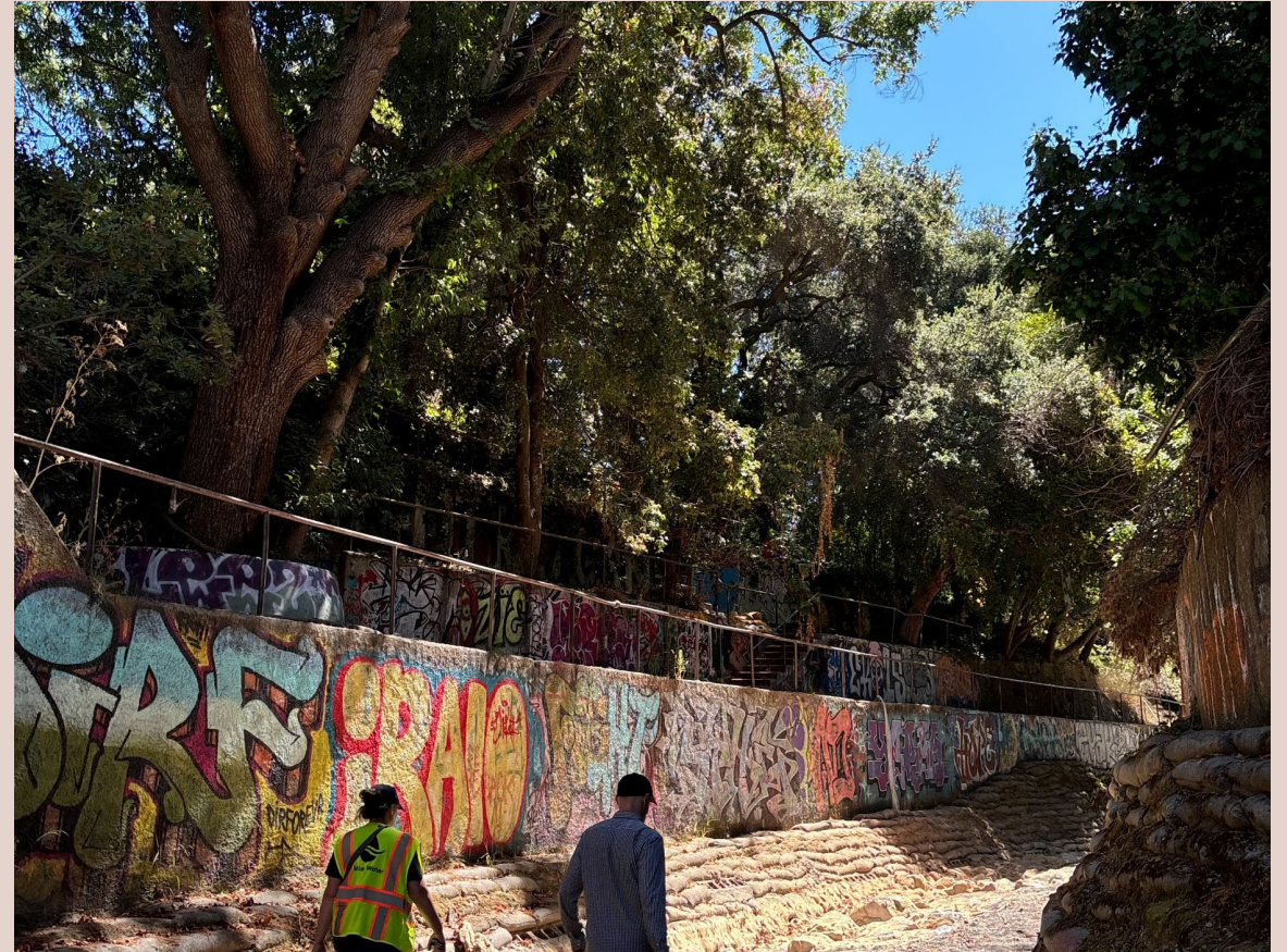
Reach 2 Project Area, widening Site 2