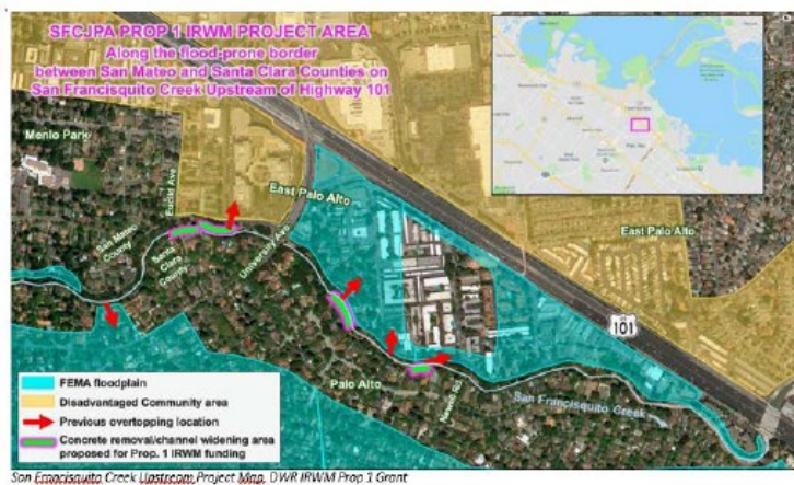
Map of Project Area for DWR Prop 1 Project Elements Project 07, SFCJPA Upstream Project

Project Location: East Palo Alto, California (37.45881, -122.14282)